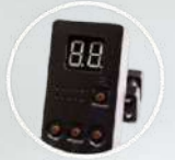
SCREW COUNTER BC-01